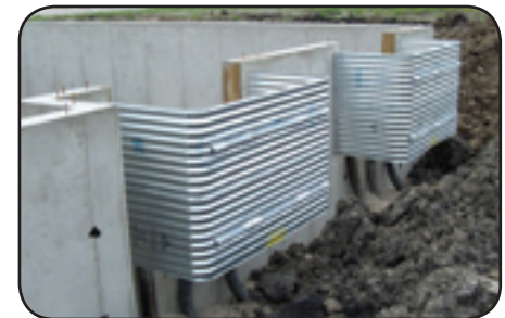
Window wells are connected to the drain tile system.

For more information or to request a seasonal waiver form, contact us at 701-476-7867 or download one from our Web site www.cityoffargo.com/wastewater .